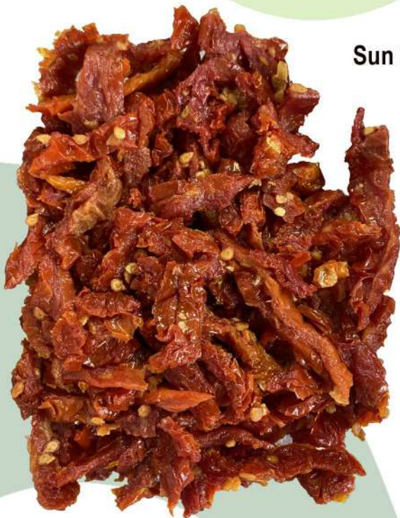
Sun Dried Tomato - Julienne Cut*