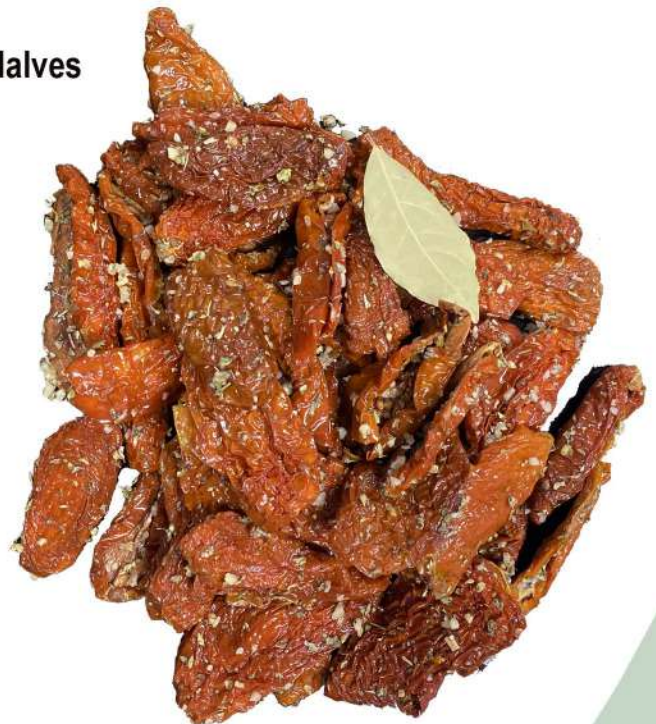
Sun Dried Tomato with Herbs