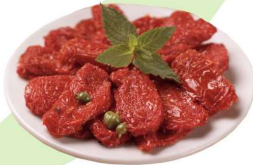
Sun Dried Tomato Halves

A traditional Mediterranean ingredient, Sun Dried Tomatoes are a wonderful as pizza toppings, in sandwiches, and paninis, pasta and wraps, and in many other recipes!