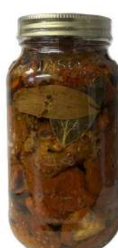
Sun Dried Tomatoes