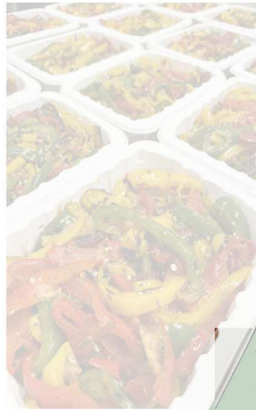
Grilled Mixed Bell Peppers